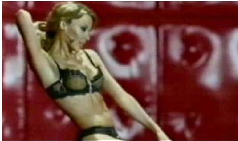
Raunchy ... Kylie Minogue in Agent Provocateur advert